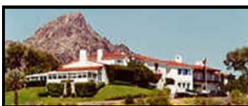
Phoenix's Wrigley Mansion Tour