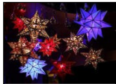
The Tubac Christmas Festival

Email: Info@Havelock-Adams.com / Ph: 602.881.6703