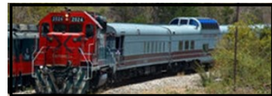
Copper Canyon Rail