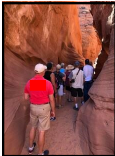
Overnight Horseshoe Bend Canyon hike.

passenger van at $99 per person. The balance of the scheduled tours range from $199 to Over $1,800 per person. The average per person rate for this segment of the business is $425. Located in one of the country's largest retired & snowbird centers, bookings for next year are already starting. The basic tour business is supplemented by major vacation tours provided by affiliate/partners. Trips to the California Bay and Wine Country, northwest tours and Canada are also available to the business. The Net Seller's Discretionary Cashflow equals 64% to 75% of gross sales. This is not a couch potato business, but if you enjoy people and like to keep busy visiting interesting events and places, this tour guide company is the ticket. The business is currently operated in total by the seller. Future growth would most likely be best provided for by a couple or team.