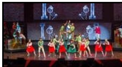
Show and Theater Packages