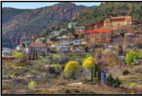
“Haunted Jerome” Tour

CONFIDENTIAL FAST GROWING SOUTHWEST US TOUR BUSINESS