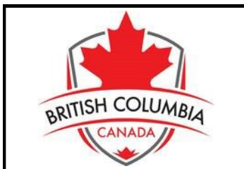
Affiliate Vacation Tours

passenger van at $99 per person. The balance of the scheduled tours range from $199 to Over $1,800 per person. The average per person rate for this segment of the business is $425. Located in one of the country's largest retired & snowbird centers, bookings for next year are already starting. The basic tour business is supplemented by major vacation tours provided by affiliate/partners. Trips to the California Bay and Wine Country, northwest tours and Canada are also available to the business. The Net Seller's Discretionary Cashflow equals 64% to 75% of gross sales. This is not a couch potato business, but if you enjoy people and like to keep busy visiting interesting events and places, this tour guide company is the ticket. The business is currently operated in total by the seller. Future growth would most likely be best provided for by a couple or team.